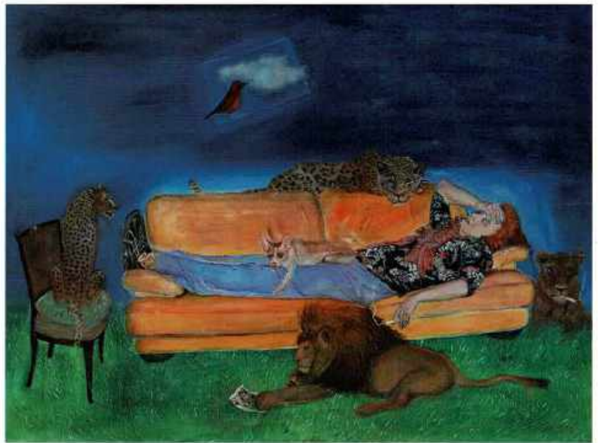
Therapy Acrylic on Canvas, 36" x 48"